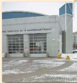
PICP withstands salt and snow plowing, a regular part of Toronto winters.

tion of frost in pavements. The pavement is plowed and salted in the winter, but not sanded to prevent clogging of the aggregate in the openings and reduced infiltration. The lack of raised curbs enables snow plows to push snow directly off the pavement.