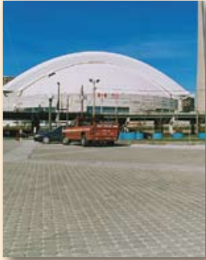
Adjacent to the Toronto SkyDome and the CN Tower in Toronto, this fire station uses PICP to reduce runoff pollutants entering nearby Lake Ontario.