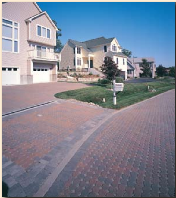
Runoff quantity and quality from driveways were monitored from water exiting slot drains.

Runoff and pollution monitoring has demonstrated the benefits of permeable interlocking concrete pavements in the U.S. EPA funded Jordan Cove Urban Watershed National Monitoring Project. Driveways and a municipal street were paved in this low-impact, environmentally sensitive residential development.