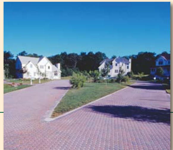
Rather than being paved, the center of the cul-de-sac in Glen Brook Green subdivision provides a bioswale to absorb runoff and overflow from the permeable pavement.