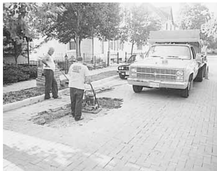
Figure 3. Compaction of the base