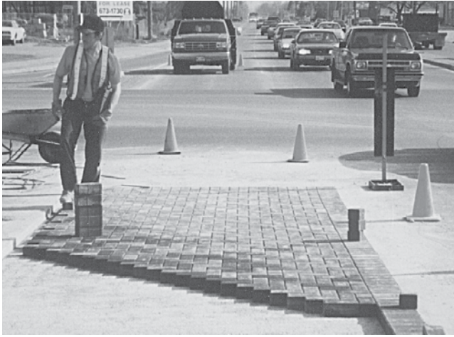
Figure 12. Pavers are laid in a 90 degree herringbone pattern between the border courses.