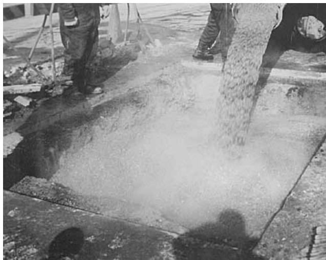
Figure 11. Low density concrete fill (unshrinkable fill) poured into a utility trench from a ready-mix concrete truck.