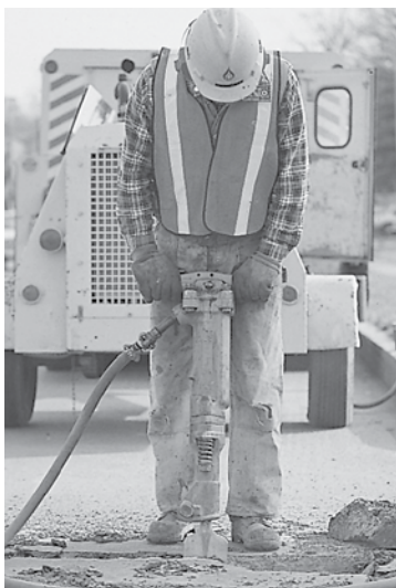
Figure 1. Repairs to utilities are a common sight in cities, incurring costs to cities and taxpayers.

The annual cost of utility cuts to cities is in the millions of dollars. These costs can be placed into three categories. First, there are the initial pavement cut and repair costs .