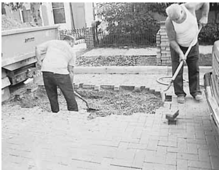
Figure 2. Removal of concrete pavers for a gas line repair in Dayton, Ohio.

Pavement damage fees may be necessary for conventional, monolithic pavements (asphalt and cast-in-place concrete) because they rely on the continuity of these materials for structural performance and durability. Cuts reduce performance because the continuity of the pavement surface, base, and subgrade has been broken. Traffic, weather, de-icing salts, and discontinuities in the surface, in the compacted base, and in the soil, shorten the life of the repaired cut. When pavement life is shortened, rehabilitative overlays are needed sooner than normal, thereby incurring maintenance costs sooner than normal.