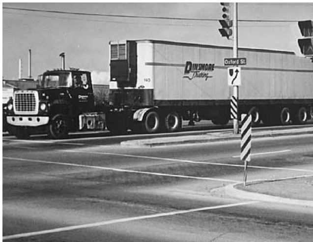
Figure 10. A patch of barely discernable pavers in a heavily trafficked intersection in London, Ontario

Spread, sweep and compact sand into the joints. The joint sand is typically finer than the bedding sand, and should conform to the grading requirements of ASTM C 144 (11) or CSA A179 (10). The joints must be completely full of sand after compaction. Remove excess sand and other debris. The pavers may be painted with the same