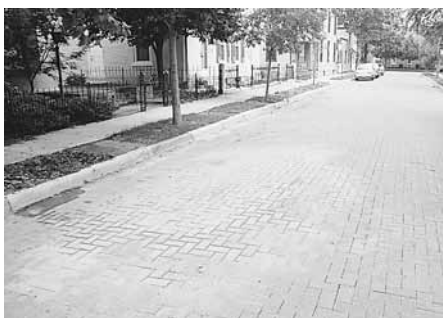
Figure 5. The final paver surface is continuous. There are no cuts or damage to the pavement.