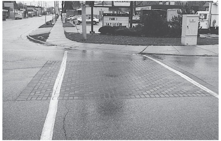
Figure 13. Concrete pavers in utility cuts can be painted as any other pavement.

lane, traffic, or crosswalk markings as any other concrete pavements (Figure 13).