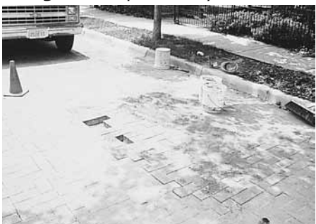
Figure 4. Reinstatement of the pavers, bedding and joint sand