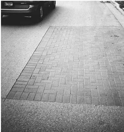
Figure 8. Utility cut repair in a residential area in London, Ontario.