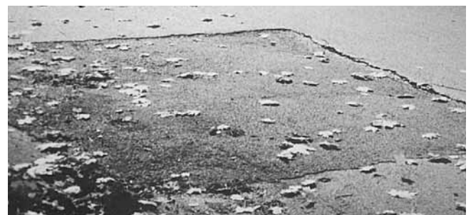
Figure 7. Pavement damage from settlement and shrinkage of cold patch asphalt.

Concrete pavers on low density concrete fill have been successfully used as a replacement for cold patch asphalt (Figures 8 and 9). They were first used as a temporary repair with the intent of being removed in the spring. However, the pavers performed so well that the City of London left them in place indefinitely. Several repairs were in streets subject to heavy truck traffic, as well as residential streets. Costs were less than using cold