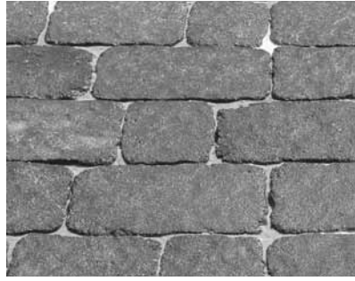
Figure 4. Liquid joint sand stabilizers can deepen the surface color slightly and they provide some surface sealing as well. Tumbled pavers shown here have wider joints than other shapes. These type of pavers can require stabilization of the joint sand.