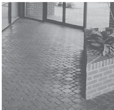
Figure 1. Many sealers enhance the appearance of concrete pavers and protect against staining.

Commercial stain removers available specifically for concrete pavers provide a high degree of certainty in removing stains. Many kinds of stains can be removed while minimizing the risk of discoloring or damaging the pavers. The container