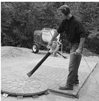
Figure 6. Whether using liquid or dry joint stabilization materials, the surface of the pavers should be cleaned with a blower or broom after the joint sand is compacted into the joints.

Stabilization benefits pavements subject to aggressive, regular cleaning. Examples might include amusement parks and restaurant exteriors. Pavements that see regular, heavy rainfall can benefit from stabilization of the joint sand. Surfaces that experience concentrated water flow such as gutters receiving sheet flow from large areas or at the drip lines under the eaves of buildings will better resist erosion of joint sand if stabilized.