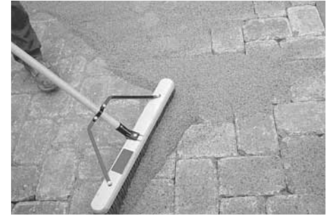
Figure 5. Joint sand can be pre-mixed and delivered to the site (typically in bags), or mixed with stabilizer at the site, then swept into the joints, compacted for consolidation in them to create interlock, and wetted to activate the stabilizer.

ment as a result of silts or other fines working their way into spaces between the sand particles. The rate of stabilization depends on the amount and sources of traffic, plus sources of fines that work their way into the joints from traffic over time.