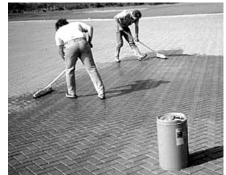
Figure 10. Urethane is applied with squeegees to stabilize joint sand between pavers on aircraft pavement.

Sealer should be spread and allowed to stand in the chamfers, soaking into the joints. Penetration