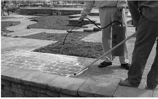
Figure 3. This liquid joint sand stabilizer is applied with a low-pressure sprayer and squeegeed across the surface after allowing some time for soaking into the joints. This helps maintain slip and skid resistance of the paver surface.