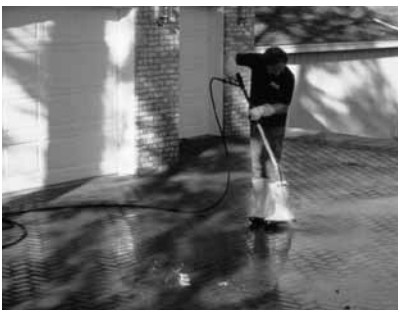
Figure 2. Pressurized cleaning equipment used by professional cleaning and sealing companies can bring out the best appearance from pavers.

If there is a need to remove deposits before they wear away, best results can be obtained by using a proprietary efflorescence remover. The acid in proprietary cleaning chemicals is buffered and blended with other chemicals to provide effective cleaning without damage to the paver surface. Always refer to the paver supplier or chemical company supplying the chemicals for recommendations on proper dilution and application of chemicals for removal of efflorescence. They are generally applied in sections beginning at the top of slope of the pavement. If the area is large, a sprayer is an efficient means to apply the cleaner. The chemicals are scrubbed on