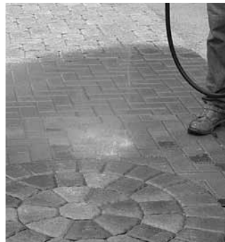
Figure 7. Dry-applied joint sand with a stabilizer is wetted in order to activate it and stiffen the sand. Once the joints dry, they are stabilized.

Stabilizers have been effective in securing joint sand in places subject to high winds such as in desert climates. They can prevent joint sand displacement from high-speed tire traffic. Like sealers, joint and stabilization materials reduce the potential for weeds and ants in the joints. In residential applications stabilization at downspouts and under eaves helps keep joint sand in place. Tumbled pavers (cobble stone-like units) and circular patterns have wider joints than other paver shapes. Tumbled pavers may require stabilized joint sand between them if they have slightly irregular sides and wide joints.