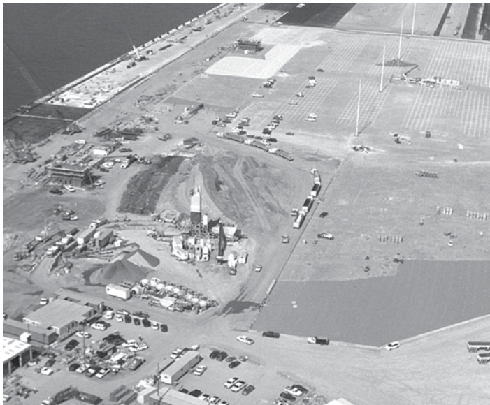
Figure 14. The Port of Oakland, California, is the largest mechanically installed project in the western hemisphere at 4.7 million sf (470,000 m 2 ).

ASTM C 936, Standard Specification for Solid Concrete Interlocking Paving Units, Annual Book of Standards , Vol. 04.05, ASTM International, Conshohocken, Pennsylvania, 2008. CSA A231.2, Precast Concrete Pavers , Canadian Standards Association, Rexdale, Ontario, 2006. ASTM C 140 Standard Test Methods for Sampling and Testing Concrete Masonry and Related Units, Annual Book of Standards , Vol. 04.05, ASTM International, Conshohocken, Pennsylvania, 2007. ASTM C 418, Standard Test Method for Abrasion Resistance of Concrete by Sandblasting, Annual Book of Standards , Vol. 04.02, ASTM International, Conshohocken, Pennsylvania, 2005. BS 6717: Part 1: 1993; Precast Concrete Paving Blocks . British Standards Institute, London, England, 1993. Dowson, Allan J., Investigation and Assessment into the Performance and Suitability of Laying Course Material , Ph.D. Dissertation, University of Newcastle, England, February, 2000. ASTM C 33, Standard Specification for Concrete Aggregates, Annual Book of Standards , Vol. 04.02, ASTM International, Conshohocken, Pennsylvania, 2007.