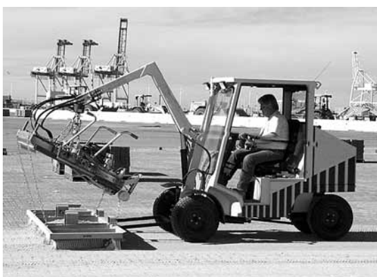
Figure 11. Sweeping jointing sand across the pavers is done after the initial compaction of the concrete pavers.

Coordination and Inspection—Large areas of paving are placed each day and often require inspection by the engineer or other owner's representative prior to initial