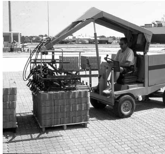
Figure 3. A cluster of pavers (or layer) is grabbed for placement by mechanical installation equipment. The pavers within the cluster are arranged in the final laying pattern as shown under the equipment.

Transportation planning for timely delivery of materials is a key element of large interlocking concrete pavement projects. Therefore, the manufacturer should include a