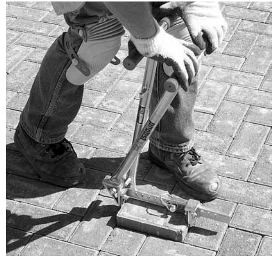
Figure 10. During initial compaction, cracked pavers are removed and immediately replaced with whole units.

brought into conformance with this specification as laying proceeds and prior to initial compaction. Sometimes the pattern may need to be changed to ensure that this can be achieved. However, specifiers should note that some patterns cannot be changed because of the paver shape and some paver cuts will need to be less than one-third.