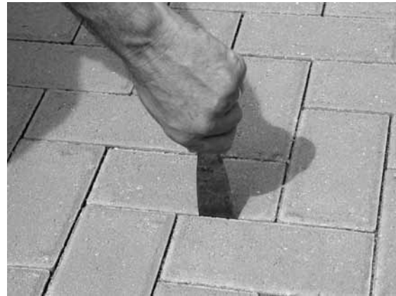
Figure 13. A simple test with a putty knife checks consolidation of the joint sand.

the longitudinal and cross slopes of the pavement are 1%. Surface elevations should conform to drawings. The top surface of the pavers may be 1/8 to 1/4 in. (3 to 6 mm) above the final elevations after the second compaction. This helps compensate for possible minor settling normal to pavements. The surface elevation of pavers should be 1/8 to 1/4 in. (3 to 6 mm) above adjacent drainage inlets, concrete collars or channels. Surface tolerances on flat slopes should be measured with a rigid straightedge. Tolerances on complex contoured slopes should be measured with a flexible straightedge capable of conforming to the complex curves in the pavement.