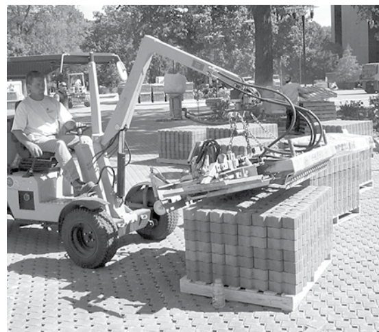
Figure 1. Mechanical installation of interlocking concrete pavements (left) and permeable units (right) is seeing increased use in industrial, port, and commercial paving projects to increase efficiency and safety.