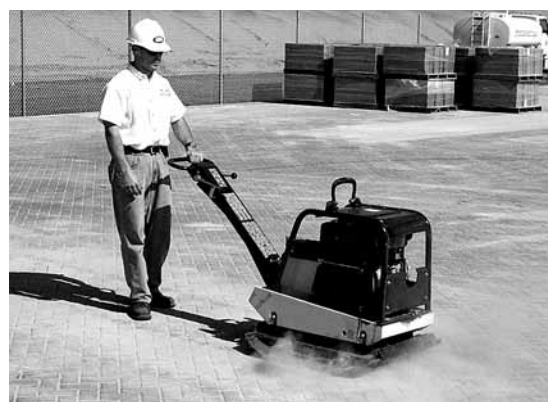
Figure 12. Final compaction should consolidate the sand in the joints of the concrete pavers.