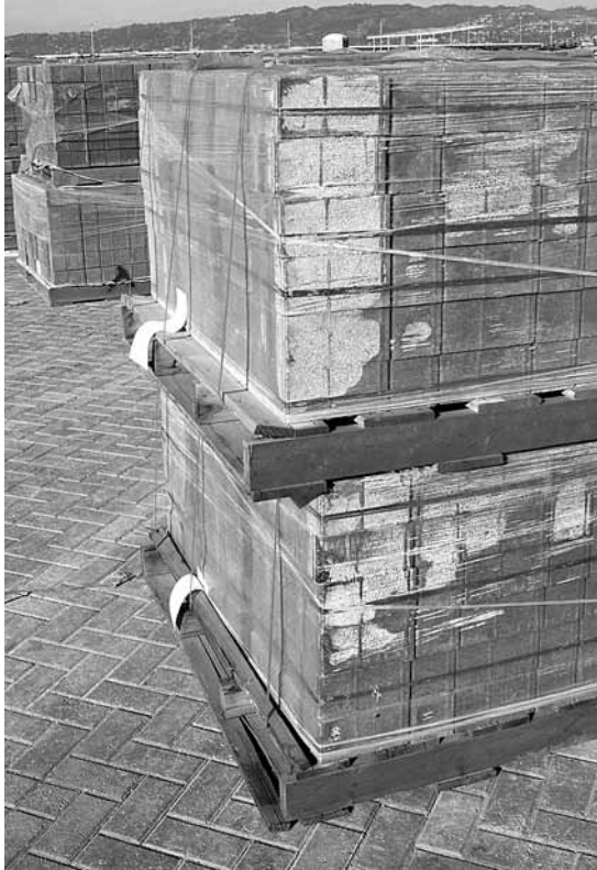
Figure 2. Bundles of ready-to-install pavers for setting by mechanical equipment. Bundles are often called cubes of pavers.

consulted for additional information on design and construction with this paving method. Other references will include American Society for Testing and Materials and the Canadian Standards Association for the concrete pavers, sands, and joint stabilization materials, if specified. Other subcontractors or the GC provides the base, drainage, and earthwork.