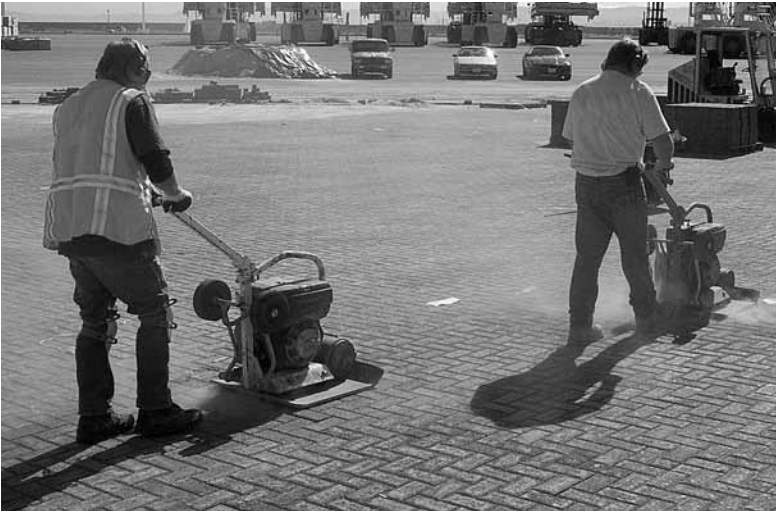
Figure 9. Initial compaction sets the concrete pavers into the bedding sand.