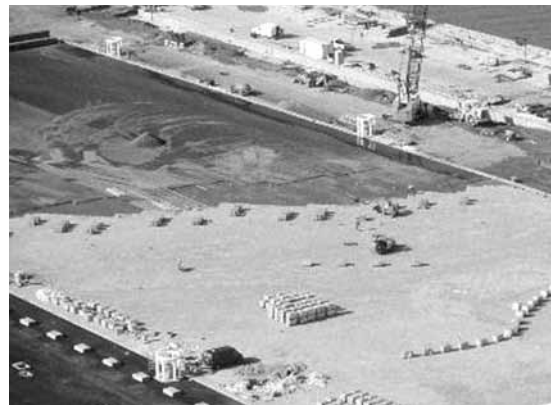
Figure 7. Maintaining an angular laying face that resembles a saw-tooth pattern facilitates installation of paver clusters.

Whenever possible cut pavers exposed to tire traffic should be no smaller than one-third of a full paver and all cut pavers should be placed in the laying pattern to provide a full and complete paver placement prior to initial compaction. Coursing can be modified along the edges to accommodate cut pavers. Joint lines are straightened and