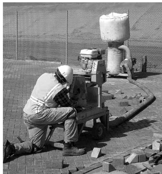
Figure 8. Edge pavers are saw cut to fit against a drainage inlet.