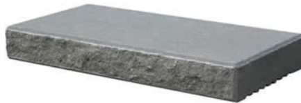
Classic 12" Cap